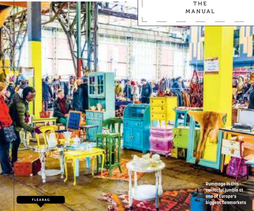
Rummage in this colourful jumble at one of Europe's biggest flea markets